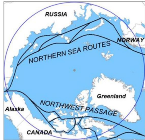
Figure 2: Northern Sea Routes and Northwest Passage.

In the Arctic, diminishing ice has led to the seasonal opening of navigable waterways that are sufficiently deep and wide for vessels to transit. In the U.S. Arctic, this specifically means additional traffic through the Bering Strait and along the North Slope of Alaska, driven by potential maritime traffic increases along the Northern Sea Routes and Northwest Passage (Figure 2). These Arctic navigable waterways are used to transport mineral, agricultural and bulk products, as well as other trade goods and passengers to, from, and within the United States. Moreover, these navigable waterways connect the U.S. Arctic region to the rest of the Nation and contribute to the movement of global commerce.