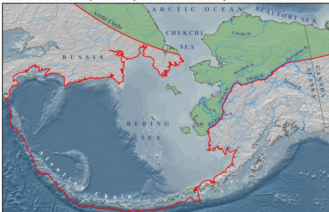
Figure 1: The geographic area covered by this report consists of all U.S. territory north of the Arctic Circle and all U.S. territory north and west of the boundary formed by the Porcupine, Yukon, Kuskokwim Rivers; all contiguous seas including the Arctic Ocean and the Beaufort, Bering, Chukchi Seas, and the Aleutian Island chain, as defined in § 112 of the Arctic Research and Policy Act of 1984 (ARPA). Source: U.S. Arctic Research Commission

All United States and foreign territory north of the Arctic Circle and all United States territory north and west of the boundary formed by the Porcupine, Yukon, and Kuskokwim Rivers; all contiguous seas, including the Arctic Ocean and the Beaufort, Bering and Chukchi Seas; and the Aleutian chain. 1